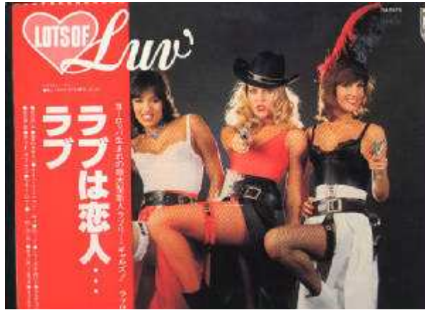
Japanese version of "Lots of Luv"