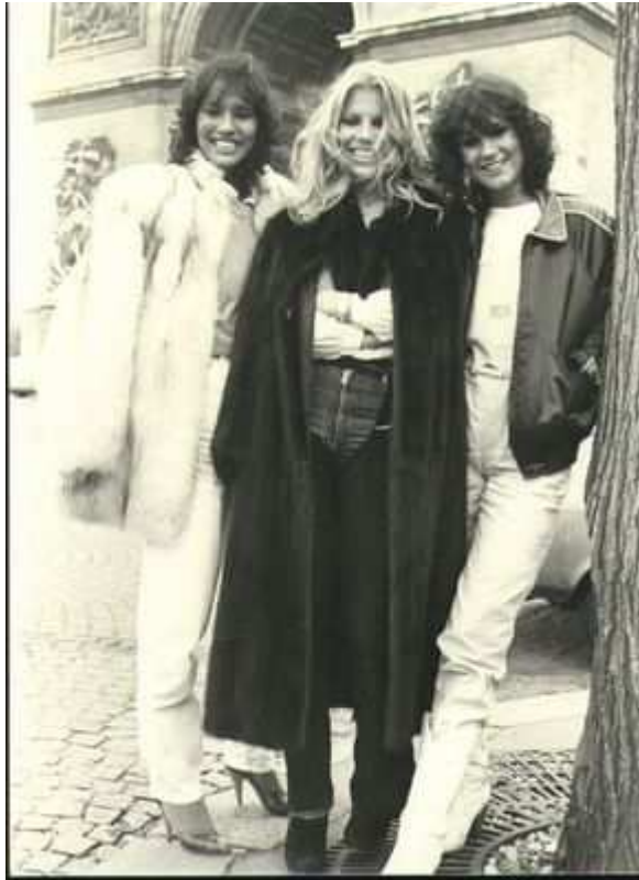
Luv' in Paris (Champs Élysées), 1980