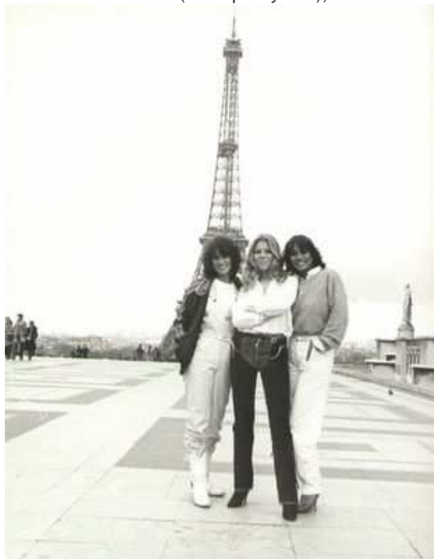
Luv' in Paris (Eiffel Tower) in 1980