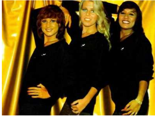
Luv' (from left to right): José Hoebee, Marga Scheide & Patty Brard