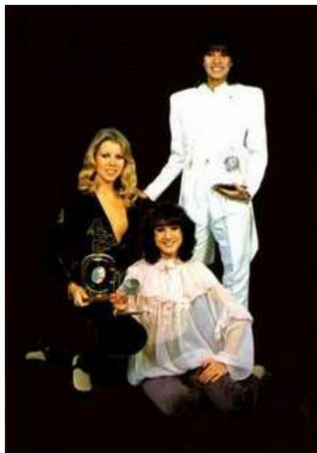
Luv' when they received the Conamus Export Prize for being Holland's best export act in 1979

After a promising first semester in 1978 due to U.O.Me's success in the Dutch and Belgian charts, things went better for Luv' . The next singles ( You're The Greatest Lover, Trojan Horse, Casanova... ) were big selling records abroad. Indeed, Luv' conquered the music charts in Germany, in Austria, in Switerzland, in Denmark, in South Africa, in Mexico, in Spain and in France.