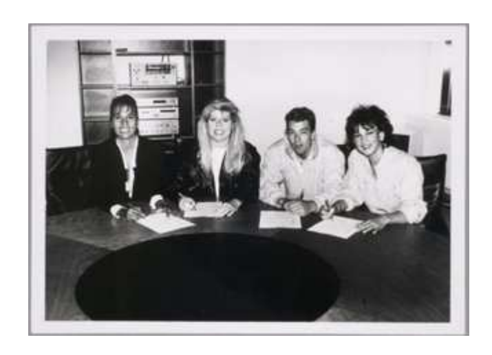
Luv' signing a contract with Arcade Records for the release of the Luv' Gold compilation in 1993.

The fact that a pop act like Luv' conquered the charts in Benelux, in German speaking countries, in Denmark, in Mexico and South Africa may be described as a lucky situation.