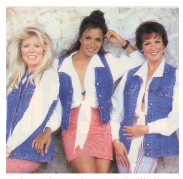
The original Luv' members: comeback (1993/1994)