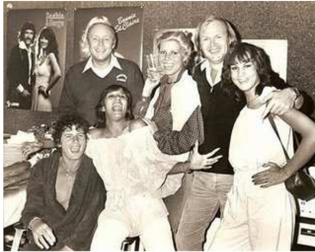
The Luv' team (from left to right): Hans van Hemert , Pim ter Linde , Patty Brard , Marga Scheide , Piet Souer and José Hoebee