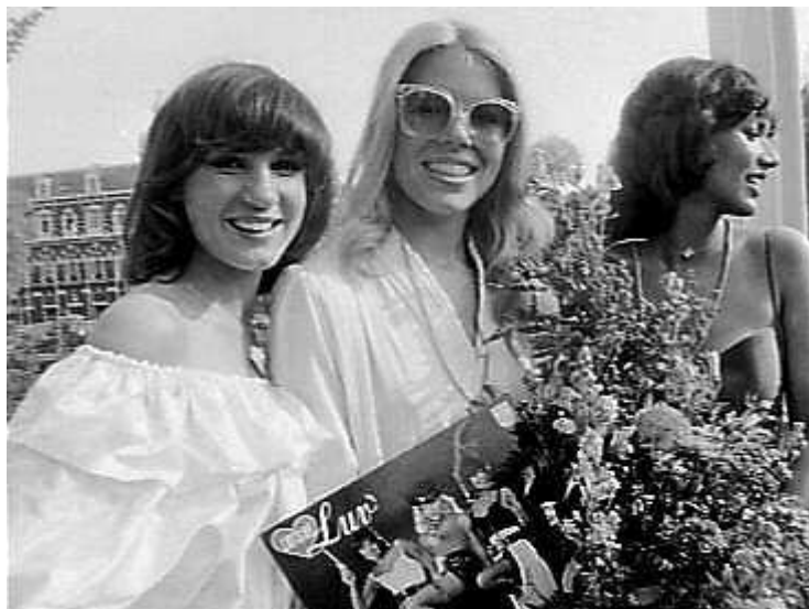
Release party of "Lots of Luv"

30 years ago, Luv' s second LP entitled " Lots of Luv " (released by Phonogram/Philips records ) entered the Dutch album charts. It rapidly became a big selling record, not only in the Netherlands but also in the neighboring European countries. I've written an article about it. To read it, see the "Articles" page.