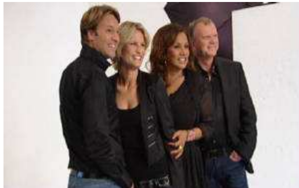
The Shownieuws team (incl. Patty Brard)