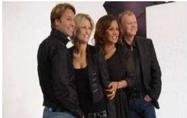
The Shownieuws team (incl. Patty Brard)