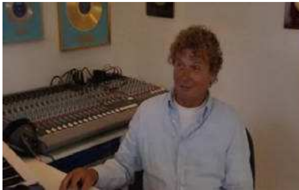
Hans van Hemert in his studio