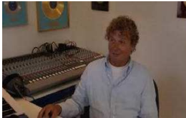
Hans van Hemert in his studio