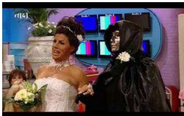
Irene Moors as Patty Brard on "TV Kantine"