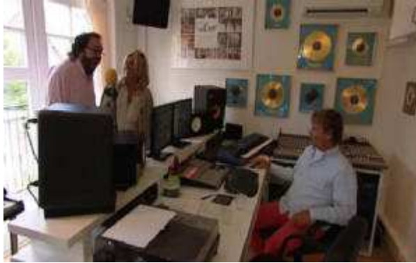
Mouth & MacNeal rehearsing in Hans van Hemert's studio