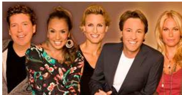
Patty Brard and the " Shownieuws " crew