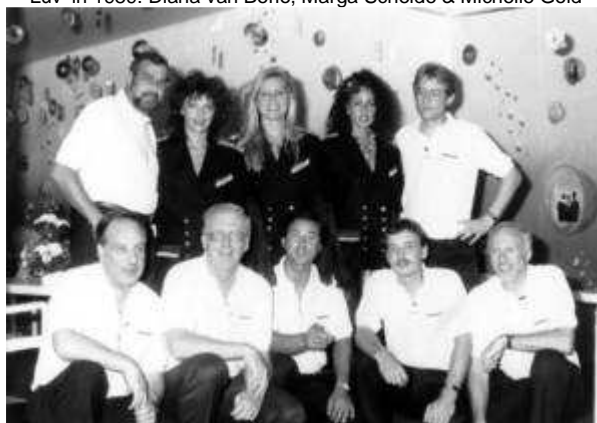
Luv' and the Dureco team at a music trade fair in Hilversum (1989)