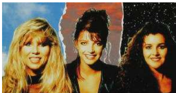
Luv' in 1991: Marga Scheide, Diana van Berlo & Carina Lemoine

* Diana's page on Wikipedia: http://en.wikipedia.org/wiki/Diana_van_Berlo