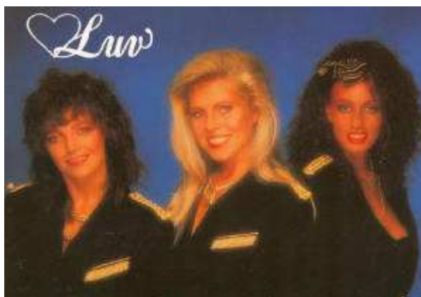
Luv' in 1989: Diana van Berlo, Marga Scheide & Michelle Gold