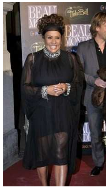
Patty Brard at the Beau Monde Awards 2008